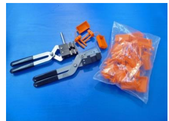
Orange Crimp System