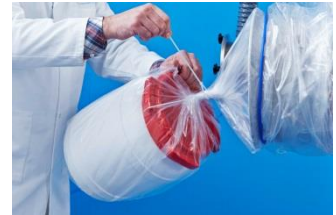
FDA grade Film for ATEX environments