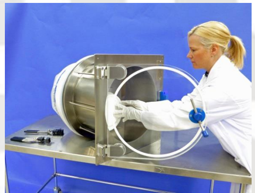
Through Wall Cleanroom Waste Disposal Port